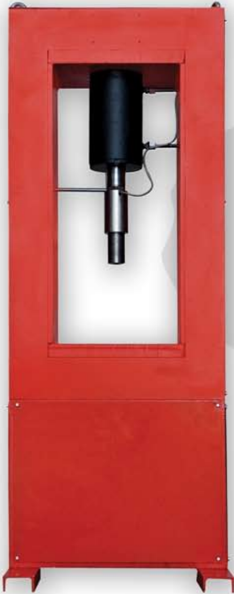
Item No: HYDCBR